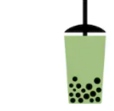
matcha green tea